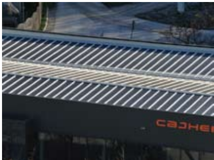
CAJHEN REZILNA ORODJA d.o.o. Laško, Slovenia