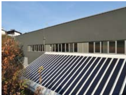
PLAN-NET d.o.o. Presežje, Slovenia