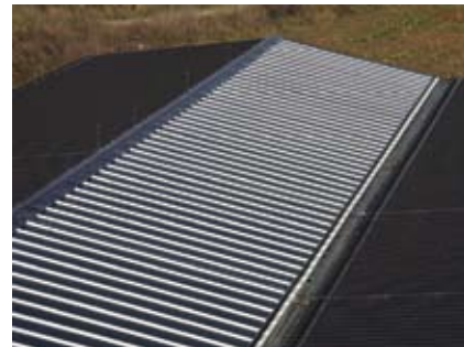
ELEKTRO KOČEVJE Kočevje, Slovenia