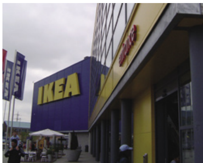
IKEA, Edmonton, United Kingdom