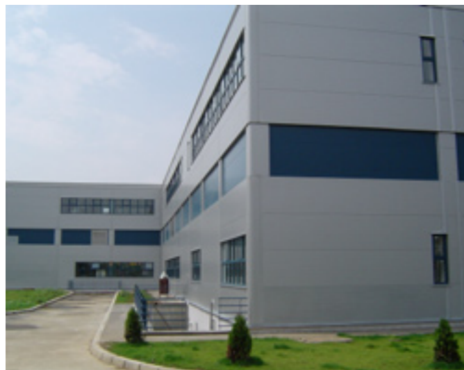
HOSPITAL, Bucharest, Romania