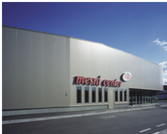
MESNI CENTER, Novo mesto, Slovenia